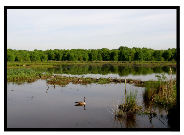
A Canada goose enjoys the increased water level as well. ( right photo )