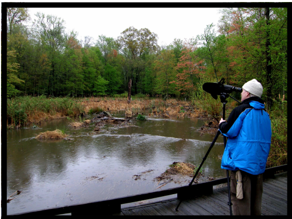
Mike Ready, on a Monday Morning Birdwalk, enjoying the abundance of water from a very wet spring. ( left photo )